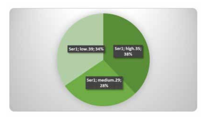
Fig. 3. Distribution of subjects by level of willpower

A low level of willpower indicates that the student is doing the easiest and most interesting thing, even if it can hurt. He is not very enthusiastic about his responsibilities, which often leads to conflict situations. His position is characterized by the famous phrase "What do I need most?". Any request or commitment is perceived by such students as almost physical discomfort. And the point here is not in the weakness of the will, but in their selfishness. They often say that they do not need willpower or that they are simply not given it. They say with some relief, "Well, I don't have the willpower."