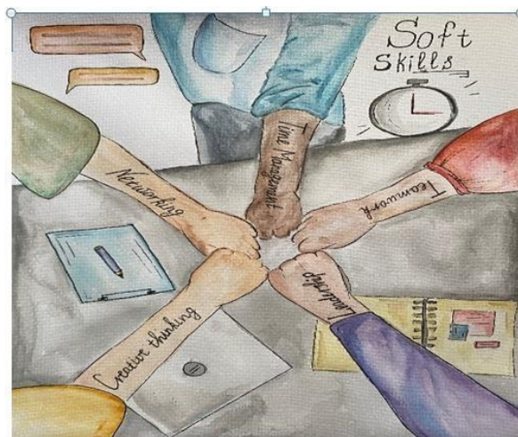
Fig. 2 Creative work by Sofia G., a future foreign language teacher

(22.4%) noted the need for more systematic implementation of soft skills development practices in the educational process, especially in vocational foreign language courses.